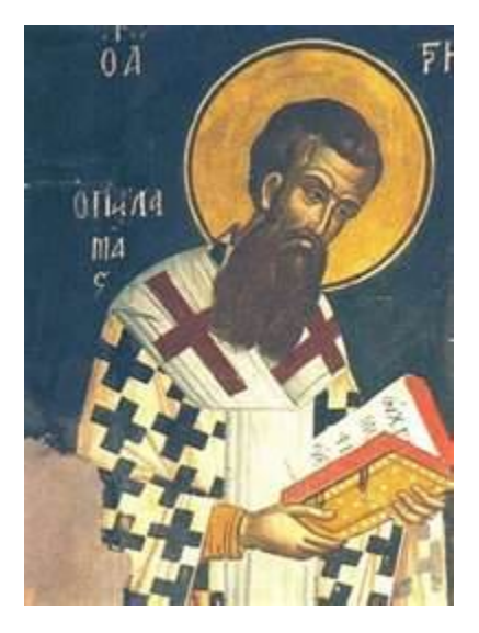
Icon of Gregory Palamas

us. Prayer and life become a seamless garment woven with the thread of daily life. Rather than separating ourselves from the world, prayer engages us fully with the world. Through both our contemplation and action the incarnation of God's presence continues in the world. Like the great icons of the eastern Christian churches, our ordinary lives and actions can become windows that draw others into an experience of God's presence and redeeming power.